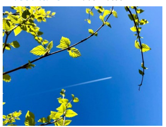
1st Place - Anabel Russel